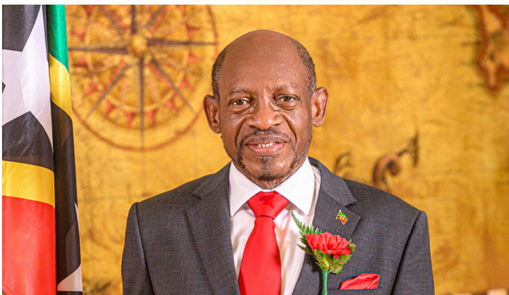
The Right Honourable Dr. Denzil Llewellyn Douglas Minister of Foreign Affairs, Economic Development, International Trade, Investments and Industry and Commerce

The Amendment has simply made the Minister responsible for Investment the Minister with those powers. The Right Honourable Dr Denzil Douglas, Minister of Economic Development and Investment, will now hold the statutory powers with respect to SKIPA.