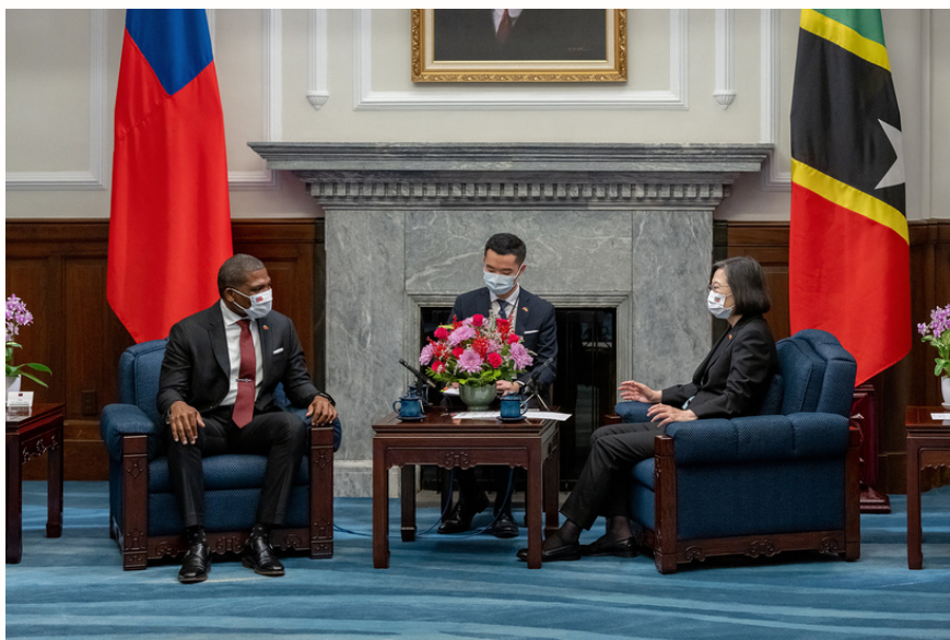
Read more at: https://www.sknis.gov.kn/2022/11/06/prime-minister-dr-drew-leads-delegation-to-taiwan-on-state-visit/