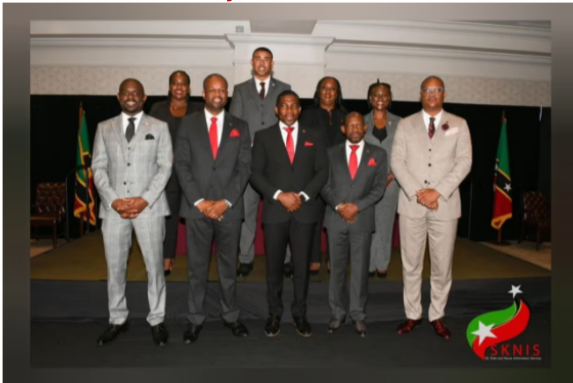
Front Row Left to Right: Hon. Samal Duggins, Hon. Konris Maynard, Prime Minister Hon. Dr. Terrance Drew, Rt. Hon. Dr. Denzil Douglas, Deputy Prime Minister Hon. Dr. Geoffrey Hanley Back Row Left to Right: Senator Hon. Dr. Joyelle Clarke, Attorney General Hon. Garth Wilkin, Hon. Marsha Henderson, Senator Hon. Isalean Phillip

Basseterre, St. Kitts and Nevis, December 7, 2022 (Press Secretary's Office): The St. Kitts and Nevis Cabinet approved the Protocol to amend Article 83 of the Revised Treaty of Chaguaramas (RTC) which gives the Caribbean Community (CARICOM) Member States more freedom to conduct their domestic affairs while adhering to their commitments under the law.