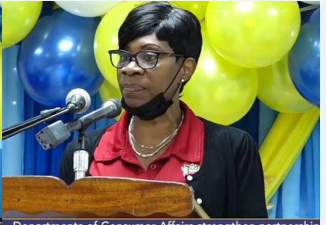
Departments of Consumer Affairs strengthen partnership