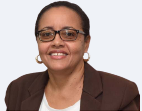
Hon. Wendy C. Phipps Minister of International Trade, Commerce, Consumer Affairs & Labour

On March 15th of each year, the global community observes World Consumer Rights Day in order to shine the spotlight on the rights and entitlements of consumers of goods and services which are purchased from manufacturers, suppliers and sellers. The theme for this year's observance of World Consumer Rights Day is "Fair Digital Finance" – a focus that is meant to stress the importance of consumers' access to financial products and services, using the digital, electronic and online platforms that have been created to boost the ease of doing business.