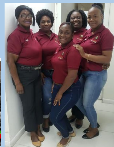
Staff of Consumer Affairs Dept.